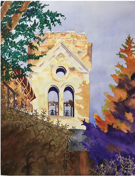
Santa Fe First Sun by Chuck Wallace