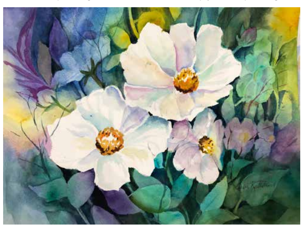
One of Leslie's paintings that shows how darker colors highlight the "main event."

Let your painting dry completely and then ask what areas need to stand out. How can you achieve this? Don't be afraid to mix really dark blue, brown, black, purple, green or combinations to accomplish this. Sometimes just a few touches with dark paint will do the trick. Make your values your goal and your colors will bring rave reviews. Think of it like packing for a trip to Europe. Remove half the clothes and pack more money.