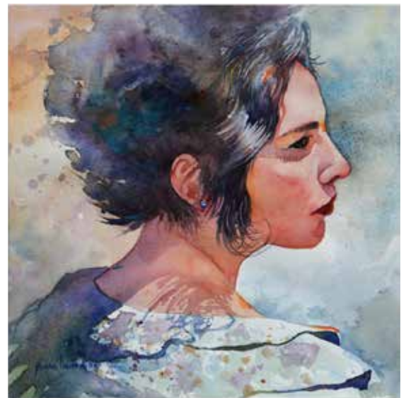
Portrait title, Lady Lane

https://waterloowatercolor.org/event/michael-holter-3-day-workshop/