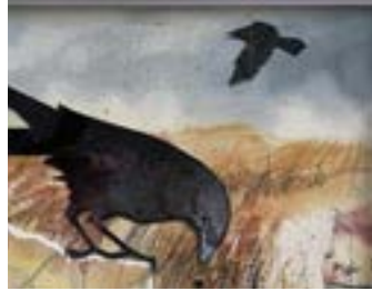
Crow's Treasure 9x12