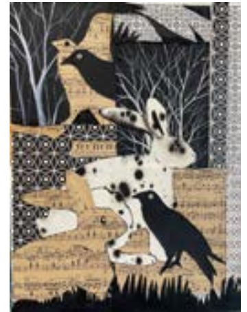
Rabbits and Crows 12x16