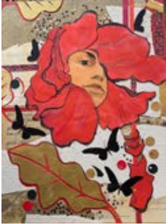
Flower Child 18x24

Helen Green is making fun collages from old watercolor paintings and assorted papers. She says, "It is a fun way to use parts of paintings to create something new."