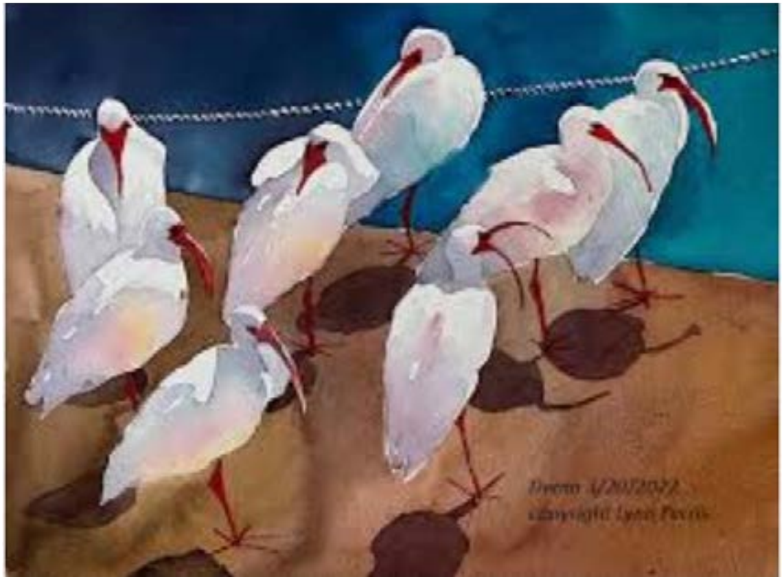
Painting by Lynn Ferris

Lynn will show students how to use light and shadow to design stronger compositions and bring drama to a variety of subject matter. Students will get lots of personal attention while gaining new skills and confidence working with light sources to create GLOW.