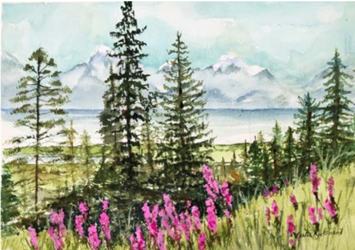
Keep those brushes wet, Leslie Kjellstrand

If you haven't already tried gouache, buy a few colors to try. I suggest white, yellow, pink and blue. You may be surprised at how much of a help it is to have an opaque paint to cover mistakes or enhance your subjects.