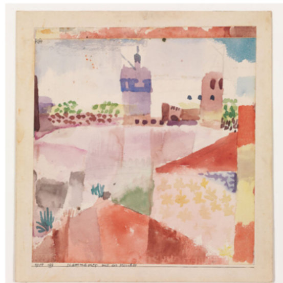
Hammamet with Its Mosque