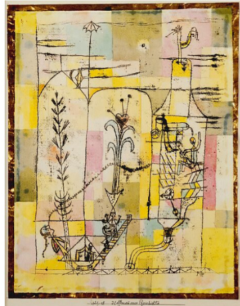
Tale à la Hoffmann

Read the entire article: https://artuk.org/discover/stories/the-surreal-and-celestial-compositions-of-paul-klee