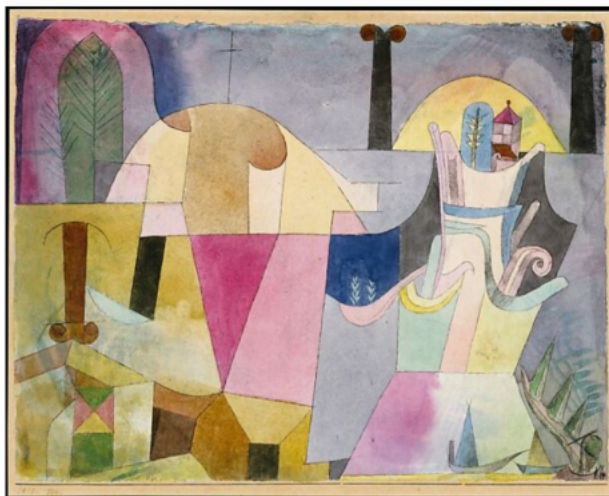
Black Columns in a Landscape